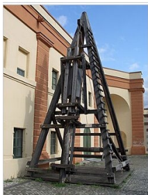
Reconstruction in Koblenz of a Roman pile driver, used to build the Rhine bridges