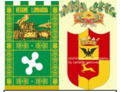
Gli Stemmi delle Lombardia e Provincia di Bergamo

The name of the Region derives from the medieval Latin Longobardia, Land of the Lombards, a Germanic population that invaded the Italian peninsula in ancient times. The Lombard king Alboin entered Pavia in 568 AD and made Pavia the capital of his kingdom. Even today, much of this regione settentrionale (Northern Italy) resembles Germanic Switzerland, certainly in topography, but also in “flavor”. Its “tempo” is far different than that in the Meridionale (Southern Italy). In previous newsletters we explored Lombardia mostly concentrating on its geography